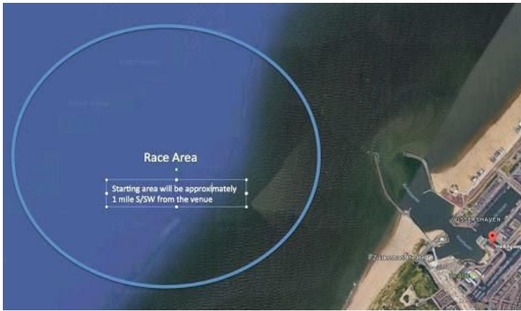
Figure 2 Racing Area.